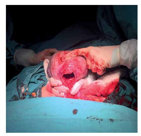
Figure 1. Manual strangulation of the uterus after placental removal

The study was approved by a local ethics committee. The patients were randomly assigned to the strangulation group (group I) and the control group (group II). A computer program was used to randomly assign the patients (random number generator, Segobit software, Issaquah, WA, USA). Manual strangulation of the uterine isthmus was performed during cesarean section in group I (n = 57; the strangulation group), whereas strangulation was not performed in group II (n = 61; the control group).